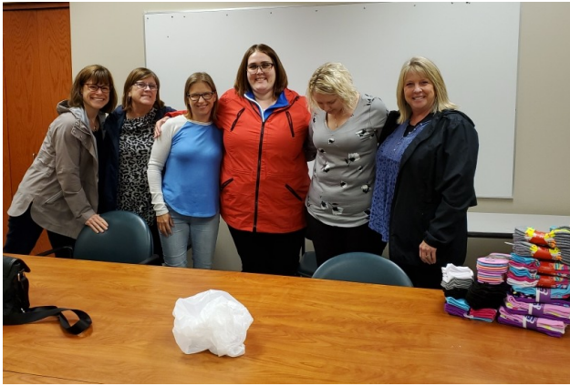
Coon Rapids Girls