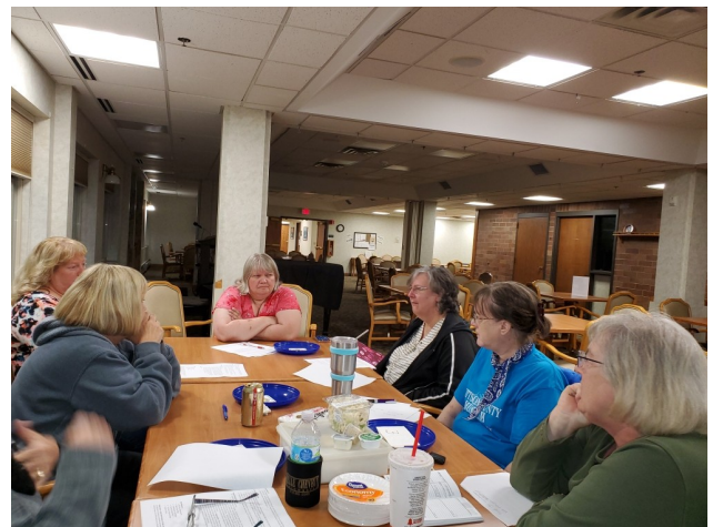
Elk River chapter meeting