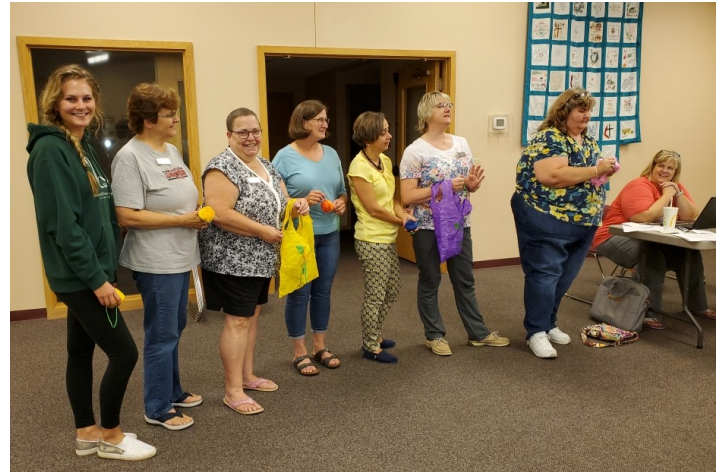
Monticello chapter meeting