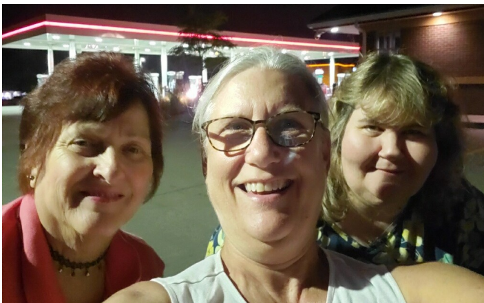
Girls went to Burnsville