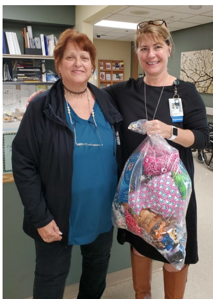
Port Pillows delivered to Princeton, Buffalo, Monticello and Maple Grove Cancer Centers